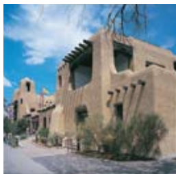
New Mexico Museum of Art