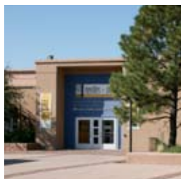
Museum of International Folk Art