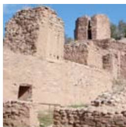
New Mexico State Monuments

On February 19, 1909, the New Mexico Territorial Legislature passed a law establishing the Museum of New Mexico, designating the historic Palace of the Governors on the north side of the Santa Fe Plaza as its home—three years before New Mexico became a State.