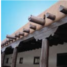
Palace of the Governors