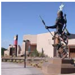
Museum of Indian Arts & Culture